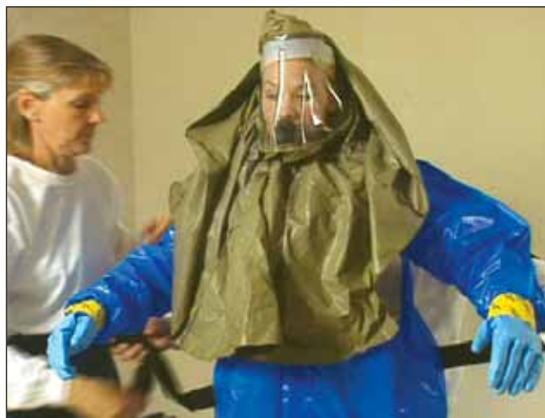
Viewers are introduced to personal protective equipment.